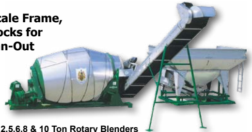
2, 5, 6, 8 & 10 Ton Rotary Blenders