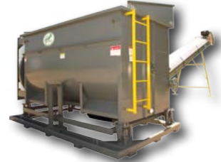
8 Ton Paddle Mixer