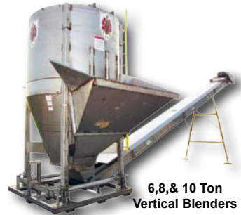
6, 8, & 10 Ton Vertical Blenders